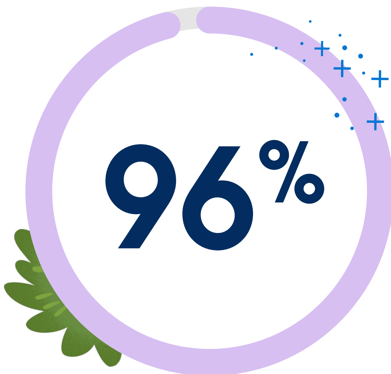
of customers improved data visibility and accuracy*